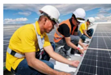
McKinsey Accelerating the journey to net zero