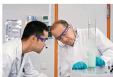
Innovative battery technology Getting sodium-ion batteries using